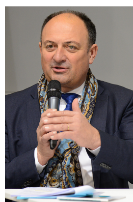
Willy Borsus President of the Walloon Government