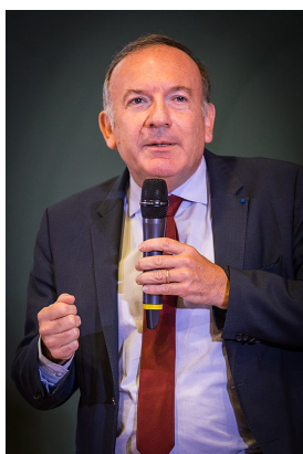
Pierre Gattaz President of the MEDEF

They were present at the Francophone Village in previous editions