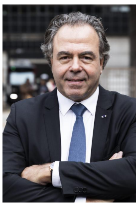
Luc Chatel Minister of Education