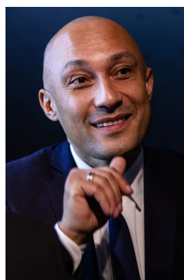
Arnaud Ngatcha Deputy Mayor of Paris in charge of International and Francophonie